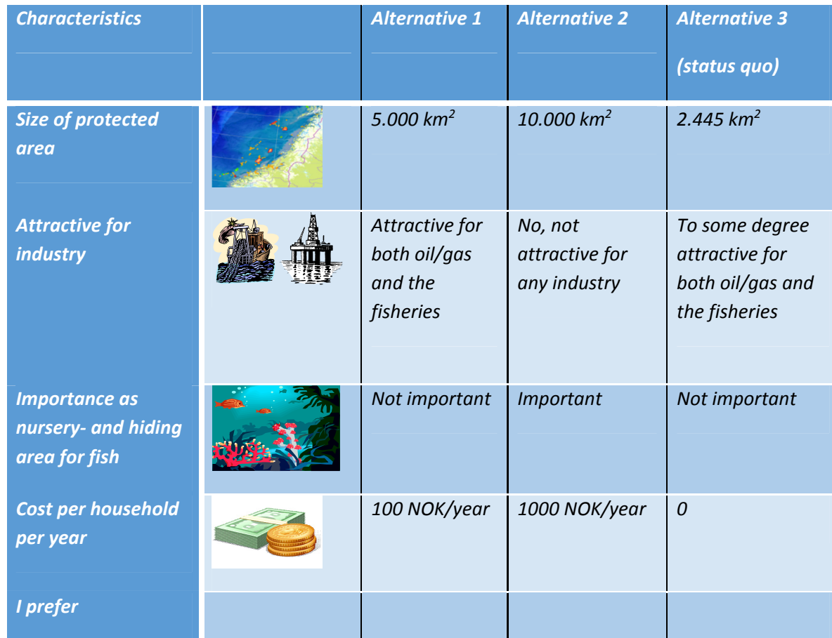
Figure 2. Example choice card from cold-water corals study